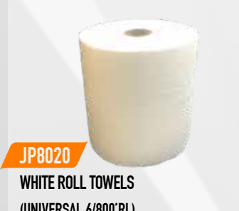
JP8020 WHITE ROLL TOWELS (UNIVERSAL 6/800'RL) (6 PER CS.) JP8020-DISP AVAILABLE DISPENSER