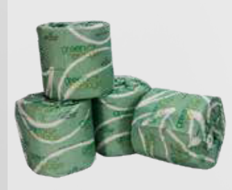
JP8150 TOILET TISSUE 2-PLY (96 ROLLS PER CS.)