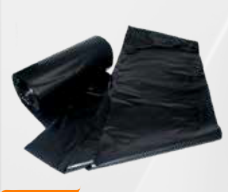
JP520 HD TRASH BAGS / 55 GAL. BLACK LINER 38" X 58" (100 CT.)