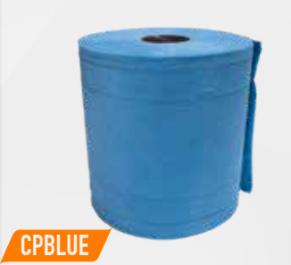
CPBLUE BLUE ROLL OF TOWELS 500' PER ROLL 12IN PERF. (2 PER CS.) JPCBLUE-DISP AVAILABLE DISPENSER