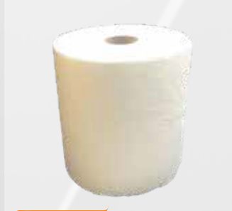
JCTRPULL PAPER TOWELS 325' PER ROLL 12IN PERF. (6 PER CS.)