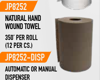
JP8252 NATURAL HAND WOUND TOWEL 350' PER ROLL (12 PER CS.)