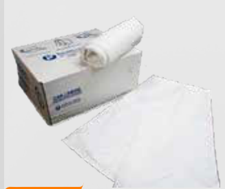
JP512 WHITE TRASH BAGS / 20 GAL. WHITE CAN LINER 30" X 36" (200 CT.)