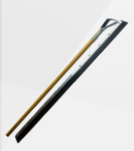
B25 36" FLOOR SQUEEGEE W/POLE