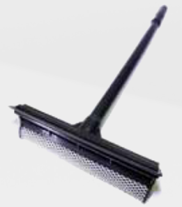
B16 WINDOW SQUEEGEE