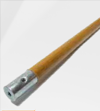
JP09 SCREW-IN MOP HANDLE