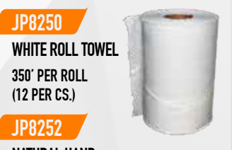
JP8250 WHITE ROLL TOWEL 350' PER ROLL (12 PER CS.)