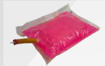
JP5000 PINK LOTION HAND CLEANER (12 PER CS. / 800 ML)