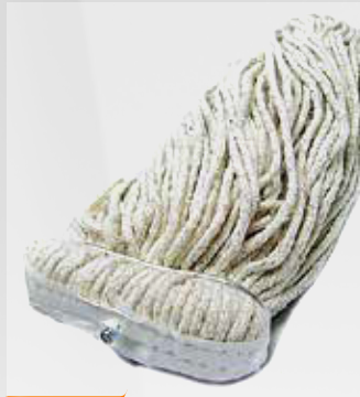
JP10 MOP HEAD / 32 oz COTTON