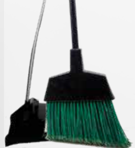
JP6372 LOBBY DUST PAN JP6373 LOBBY DUST BROOM