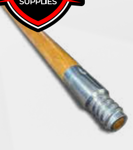
B13 5' WOOD HANDLE W/METAL THREADS