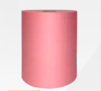
JPHD80R HEAVY-DUTY RED INDUSTRIAL WIPER 475' PER ROLL 12IN PERF. (1 PER CS.)