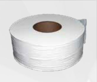
JP8100 JUMBO TOILET PAPER ROLLS 1000' PER ROLL (12 ROLLS PER CS.)